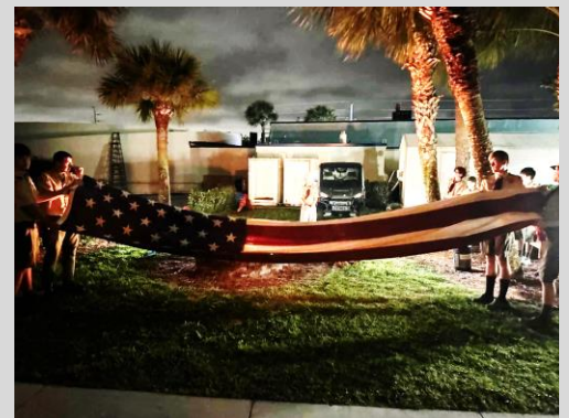
Flag Retirement Ceremony

During the campout, we had the opportunity to redeem the reputation of the BSA by camping cleanly and responsibly within the grounds of the Navy Seal Museum. The museum had poor experiences with other units that had camped prior to our stay. The first morning, some Scouts and Leaders got up early to watch the beautiful sunrise over Florida's east coast. After the sunrise, we began our day with each patrol preparing a hot breakfast. From there, we toured the museum and learned about the history of the SEALs, explored the exhibits, had lunch, ran the SEAL-style obstacle course, and finished the afternoon with a fun game of football. After dinner, we concluded our day with a Flag Retirement Ceremony and Campfire Program that included songs and skits.