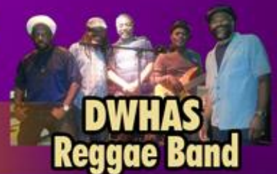
DWHAS Reggae Band