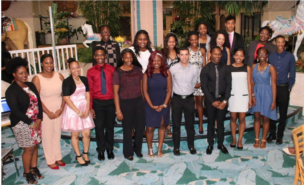
2016 Student Assistance Award Recipients