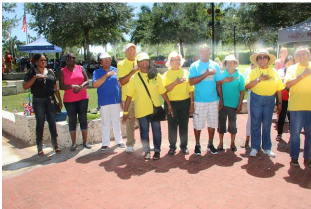
Cultural Committee and friends