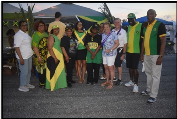
CAFCI "Island Steppers"