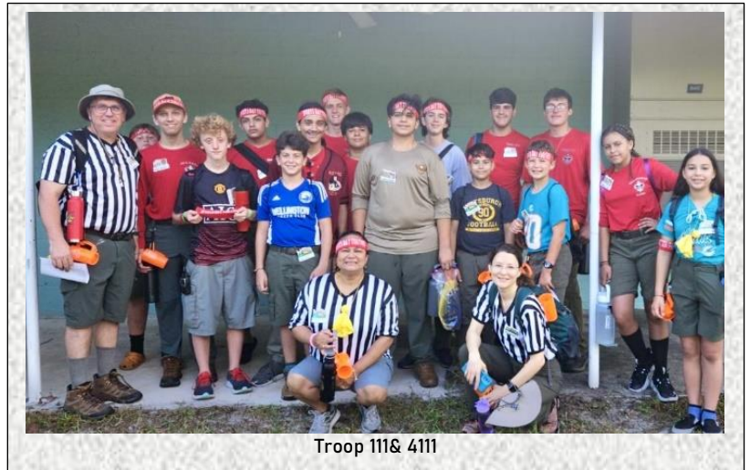
Troop 111 & 4111

Overall, it was a wonderful experience at TK, and we will definitely be returning next year. We have plans to attend Sea Base High Adventure Camp in the Keys and also Daniel Boone Camp in North Carolina later this month. With that, it has been a fun summer so far, and hopefully it will only get better. Many thanks to CAFCI for their support which makes these amazing adventures possible.