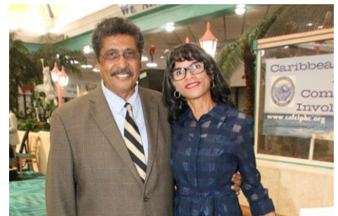
Royal Palm Beach Mayor Fred Pinto, Port of Palm Beach Commissioner Dr. Jean Enright