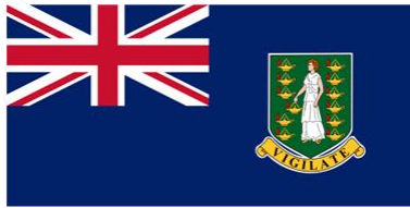
British Virgin Islands