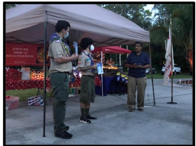
Royal Palm Beach Mayor Fred Pinto Congratulating Scouts and their Parents