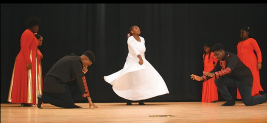
The United Overcomer Church of God Dance Group