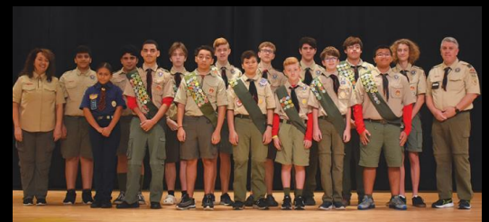
Scouts from Troop 111 and Pack 120