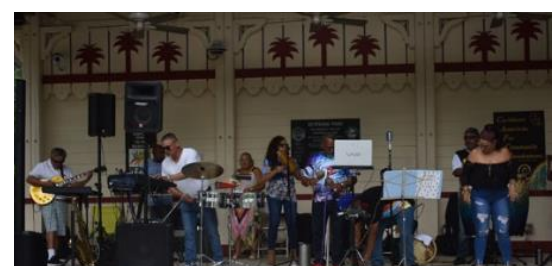
Caribe Jam Band