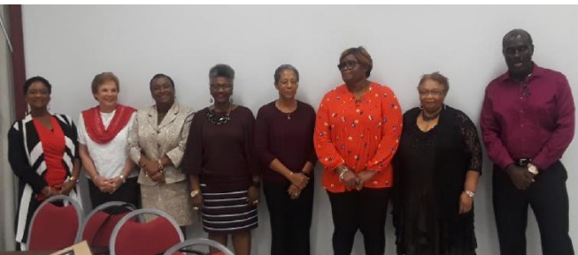
2019 Board Members